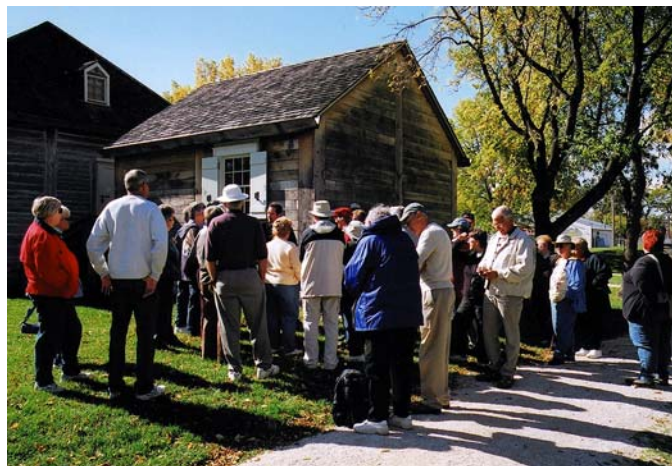
A group gathers at Ross House Museum in preparation for a walking tour of historic North Point Douglas.

Members of the Society's Historic Preservation Committee have continued to present the North Point Douglas Walking Tour that they first unveiled in 2005. On 13 August, the Manitoba Naturalists Society took the tour then, on 30 August, a group from Creative Retirement toured through North Point Douglas. If