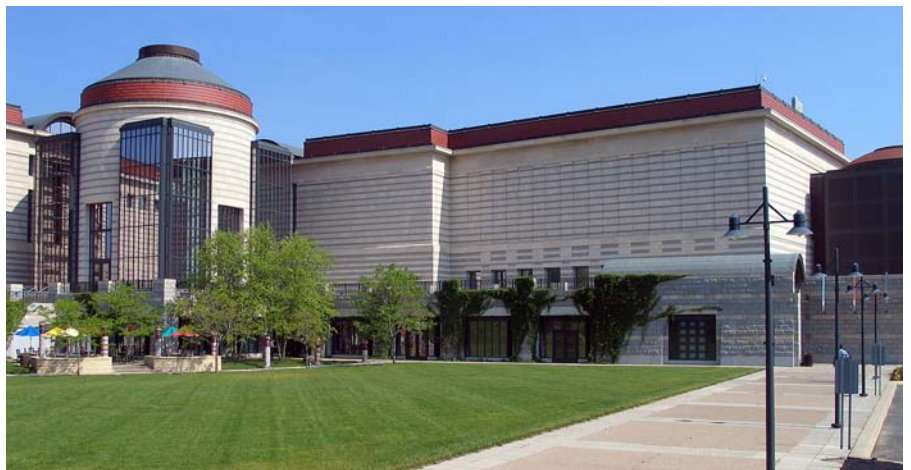
The Minnesota Historical Society's grand History Center in St. Paul houses its museum, archives, library, and offices. The MHS was established in 1849, nine years before Minnesota gained statehood, making it one of the USA's oldest.

Curiously enough, we are still having heritage functions gradually eroded away by institutions with more money and more power. Once the MHS was the major institution defending the built heritage of Winnipeg. Now we have Heritage Winnipeg. Until a few years ago, the Margaret McWilliams medals were the only important literary prizes awarded within the