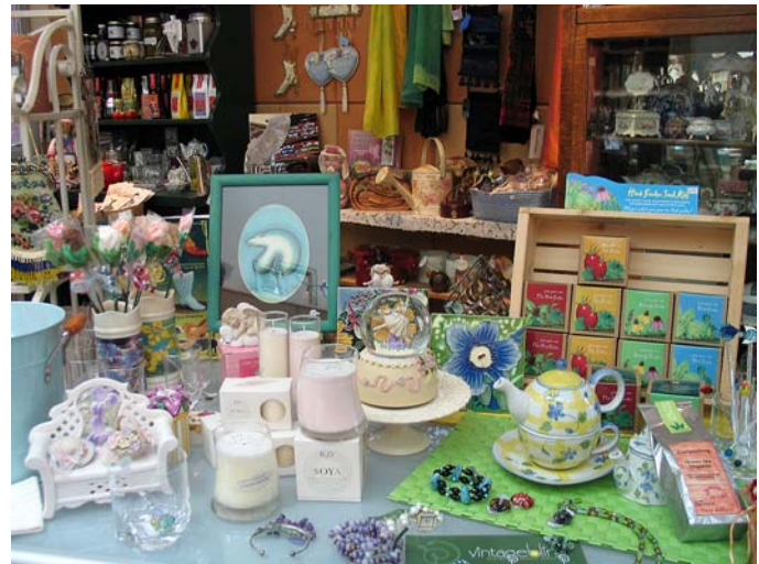
Some items available for sale at the Dalnavert Gift Shop.