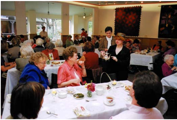
The Dalnavert Visitors' Centre was busy hosting a tea lunch on 21 September.