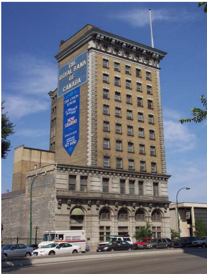
The Union Bank Building on Main Street, Winnipeg, before renovations began in 2006.

Some people prefer to do walking tour on their own. If so, the North Point Douglas Walking Tour is now available on the MHS web site where in the near future you will be able to download the tour information. It is listed along with a number of other tours of Manitoba localities.