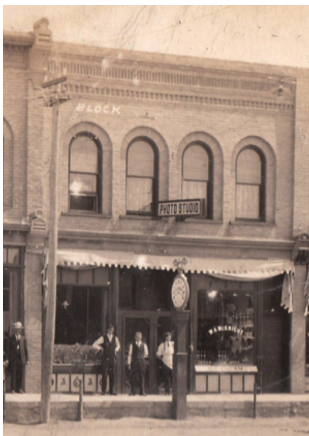
Edwards Photo Studio – second floor of the (first) Sherlock Block