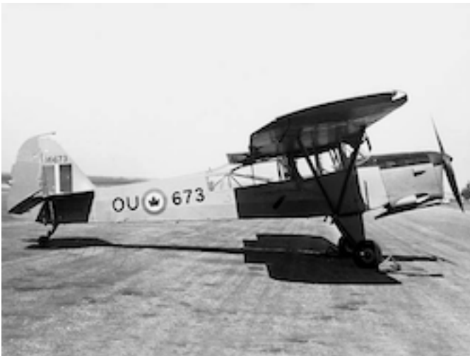
5. Harvard Trainer.