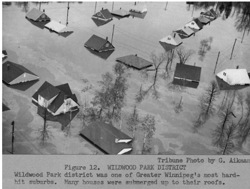
Wildwood Park in the spring of 1950 after the dikes gave way. 3

In October 1950, our family moved to a house in a new post-war suburb of the Fort Garry district in Winnipeg called Wildwood Park, which lay in the southern part of the city. Most of the small single family dwellings in this planned residential neighbourhood faced Wildwood Park itself and road access to them came from the back of the house. 2 Between April and June 1950, the Red River, which snaked around Wildwood Park on three sides, overflowed its banks and created extensive flooding beginning on May 6 th and lasting for a month or two. The subsequent cleanup delayed our arrival. I have no memory of the flood's aftermath except for the piles of sandbags along the river and the more permanent dikes surrounding the nearby Riverview area to which we later moved.