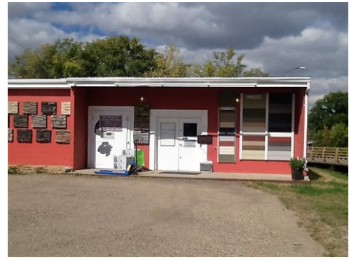
4th Ave. N Originally the Crescent Creamery, the largest independent producer of butter in Western Canada owned and operated by the Walker Family. The wood building burned in the early 1960's, replaced by the brick building today. In it's time, it has been used for dairy product distribution, a forestry depot, Youth Centre, Butcher Shop and now DAS KINDERLAND, a toy store.