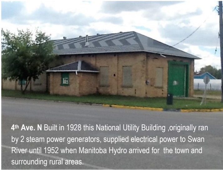
4th Ave. N Built in 1928 this National Utility Building ,originally ran by 2 steam power generators, supplied electrical power to Swan River until 1952 when Manitoba Hydro arrived for the town and surrounding rural areas.