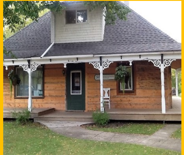
512-2 nd St. N Built in 1900 by Henry Tibble for Hugh Harley who was appointed by the government as a Land Agent to record Homestead Entries, provide information, maps of open land for incoming settlers. It is one of the first houses built in the new town sites of Swan River, serving as land office and port office and is now owned by the Swan Valley Historical Museum. www.mhs.mb.ca/docs/sites/harleyhouse.shtml