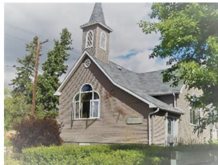
223-5 th Ave. N St. James Anglican Church built in 1941 replaced the first Anglican Church built on the same site in 1903-1904. In 1992, a new larger modern church was constructed in a new location on 1st south. The old building remained on the site to be sold. During the following years it served as a coffee house, tea house, restaurant, and space for the H.E.R.O. Club and finally a home which has kept many original features inside.