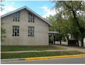
224-5 th Ave. N The First Baptist Church was organized in 1899 and first building constructed in 1902. The present building was built in 1963.