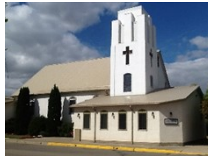
514-1 st St. N United Church built in 1950 and renovated in 2003. In 1900 the Methodist church was built here. In 1925 the Methodist and Presbyterian Church amalgamated creating the United Church of Canada.