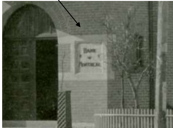
City of Regina Archives – cornerstone detail

Keywords: Architecture (8646) , commercial (1771) , Photograph (77678)